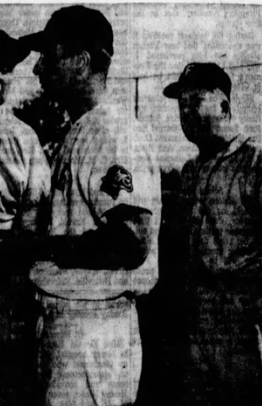
RUHARB—There were many Fremonters in the audience and a flock of major league scouts on hand to view the state baseball Class AA final Saturday afternoon in Columbus. They saw a wild state Class AA championship game on the Ohio State university Varsity diamond Saturday.

Two square-play bunts in the bottom of the seventh inning brought in the tying and winning runs for Elder, winner of the state AA baseball crown a fifth time. It was the first trip to the state for Ross high school.