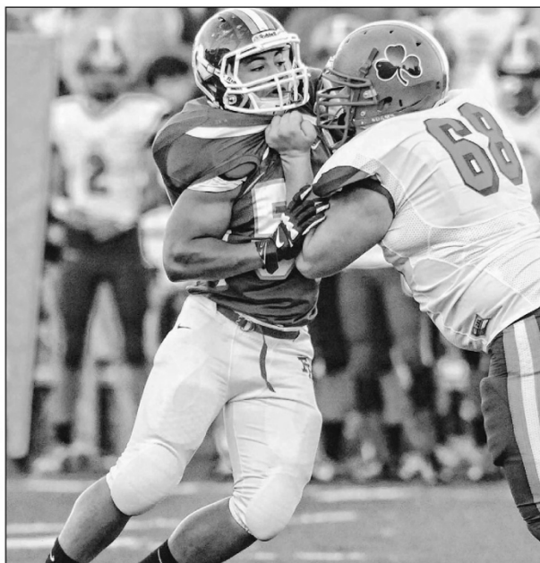
Fremont Ross look to be a tougher team in the late stages of games in 2014.