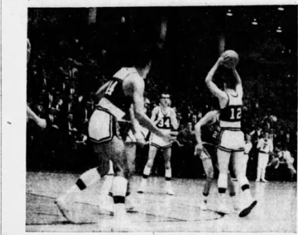
FREEZING IT: Three Ross players are shown here helping the Little Giants freeze the ball late in the fourth quarter of their tournament game Friday with Toledo St. Francis. Playing keep-