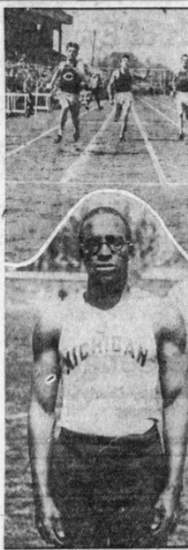
With two world records broken an field title in Northwestern Dyche 204, title record set by Roland Lo ran 100-yard dash in 23.5 ling 22