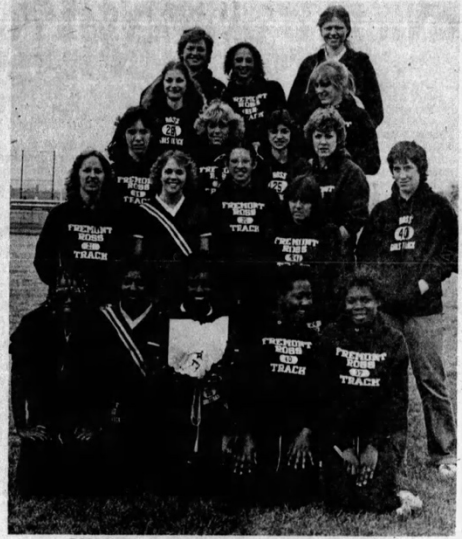
ROSS GIRLS: BUCKEYE CONFERENCE TRACK CHAMPS

Monday, May 12, 1980, The News-Messenger, Fremont, O. 17