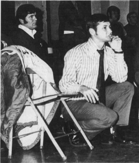
A VACANT SEAT — The chair normally used by Ross' head wrestling coach during tournament competition was vacant Saturday during the Buckeye Conference tournament at Elyria. Acting head coach