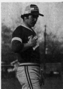
first year at guiding the Little Giants diamond team, was caught in action while signaling his hitters and base runners during a game with Findlay