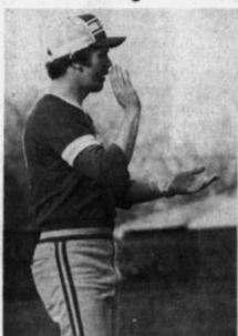
Thursday at Anderson Field. The Little Giants came up a couple of runs short while losing to the Trojans 2-1.