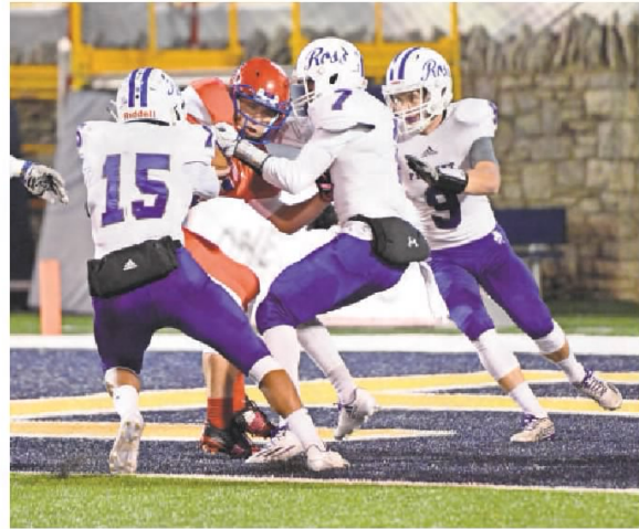
Fremont scores a touchdown after a bad snap on a St. Francis punt.