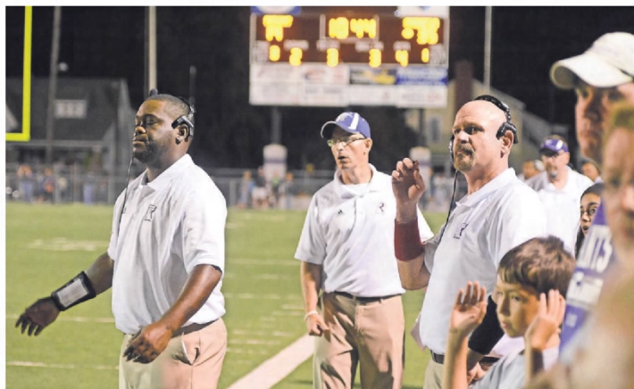
Fremont Ross coaches react to Holland Springfield scoring a fourth quarter touchdown in the Little Giants' 42-21 loss Friday night.

Ross' 42-21 loss Friday night wasn't a close decision. It was a one-sided affair which, had it been a boxing match, the referee would have stopped it long