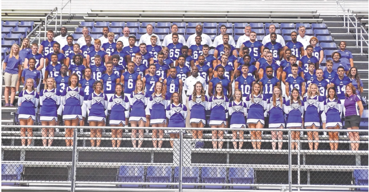
The 2015 Fremont Ross High School football team and cheerleaders.