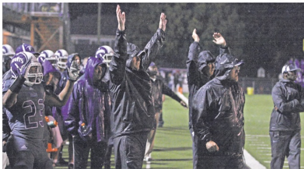
Ross' sideline reacts to a fourth quarter touchdown against Sandusky.