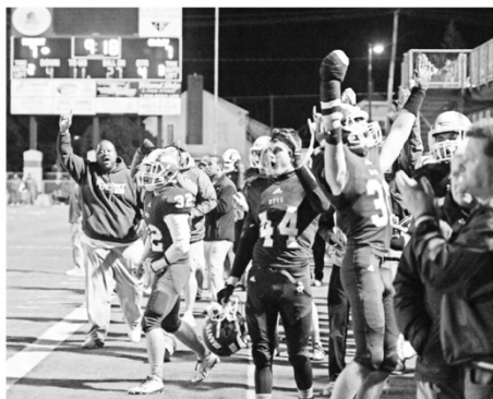
Fremont Ross football celebrates a touchdown against Clay on Friday night.