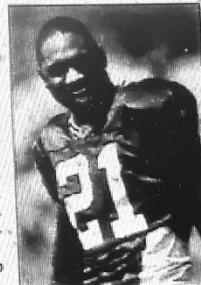
See WOODSON, A8 WOODSON