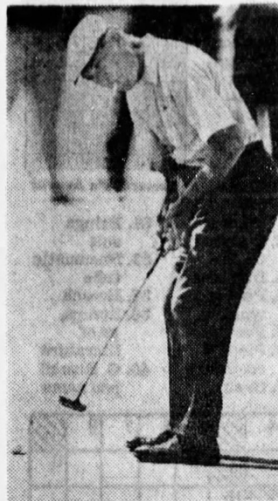
BEN HOGAN Alone On Green