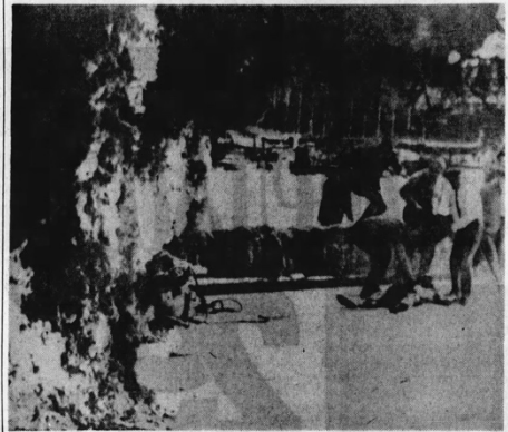
PULLED FROM INFERNO — Italian race driver Lorenzo Bandini sprawls on ground after being pulled from his flaming Ferrari during Grand Prix race in Monaco Sunday.