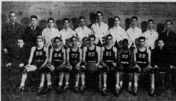
Pictured above is the 1940-41 Ross high basketball team which closed its season last Saturday by losing in the finals of the Class A district tournament in Sandusky after winning 18 of 23 games.