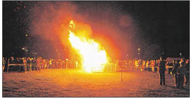
A large bonfire is lit as members of the Fremont Ross football team, family and friends gather during a pep rally at the fairgrounds Thursday.

Ross and Sandusky are both fighting for a playoff