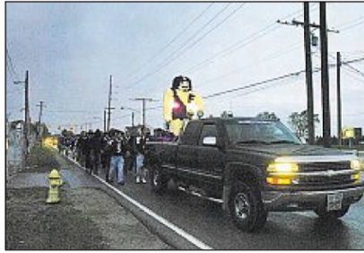
Members of the Fremont Ross football team make their way along North Street as they head to the fairgrounds for a pep rally Thursday.