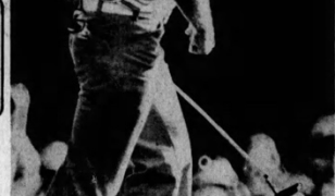
MASTERS WINNER. Tom Watson smiles after making a birdie shot on the 17th at the Masters Golf Tournament Sunday in Augusta, Ga., the shot put him in the lead and he continued through the 18th to win the 1977 Masters title.