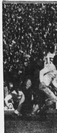
PASADENA, Cal., Jan. 4.—One capacity crowd of 85,000 who saw the above pictured action when