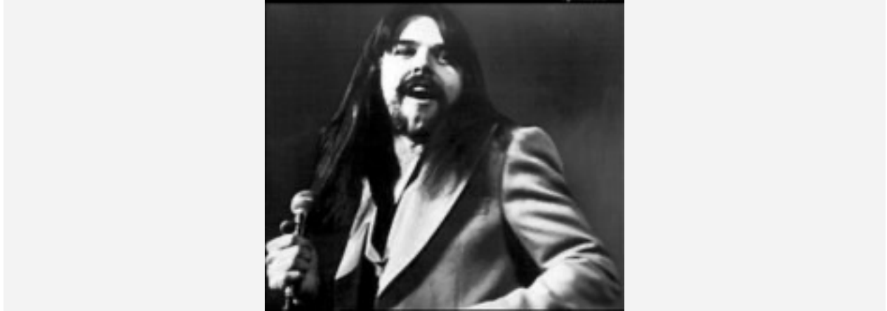
A young Bob Seger performs on the "Purple Pit" stage in 1973.

We remember the gymnasium for the night in 1973 when a little-known rock band performed on the gymnasium's stage. Bob Seger and his band, not yet called the 'Silver Bullet band,' performed for the 'young people' from around the county. So unknown was Seger at the time that the newspaper did not cover the event.