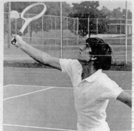
REACHING HIGH TO RETURN BALL ACROSS NET

"I hope to get to the state high school tennis tournament sometime and do well there," he says. "I would also like to get a scholarship after I graduate."