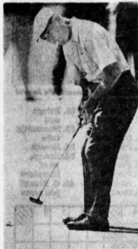
BEN HOGAN Alone On Green