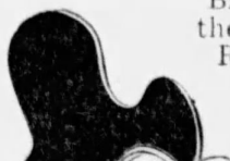
Brewster the Goebel Rooster Says

ton, Ind., where Miami's Redskins, also after their seventh straight, go against Indiana's Big Ten team which just last Saturday upset Michigan 13-9. More than 3,000 Oxford fans will trek to Bloomington for the struggle.