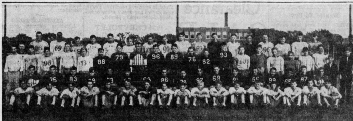
Pictured above is the 1936 squad of Fremont Ross high school's Little Giants who are undefeated in four games. The Fremonters won their fourth in a row by the lucky 12 point margin Friday night in topping Fostoria, 12-0. In other games Fremont has whipped Genoa, 12-0, subdued Tiffin Calvert, 19-7, and routed Findlay, 12-0.