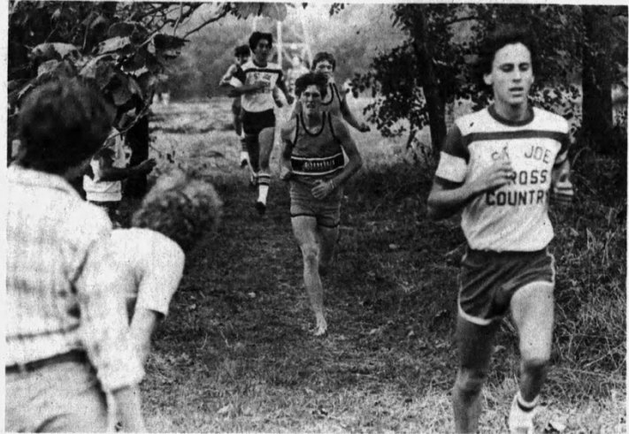
ST. JOE and Gibsonburg harriers run between country meet involving St. Joe, Gibsonburg and trees at Thornwood Golf Links during a cross Mohawk. Spectators watch as the runners go by.