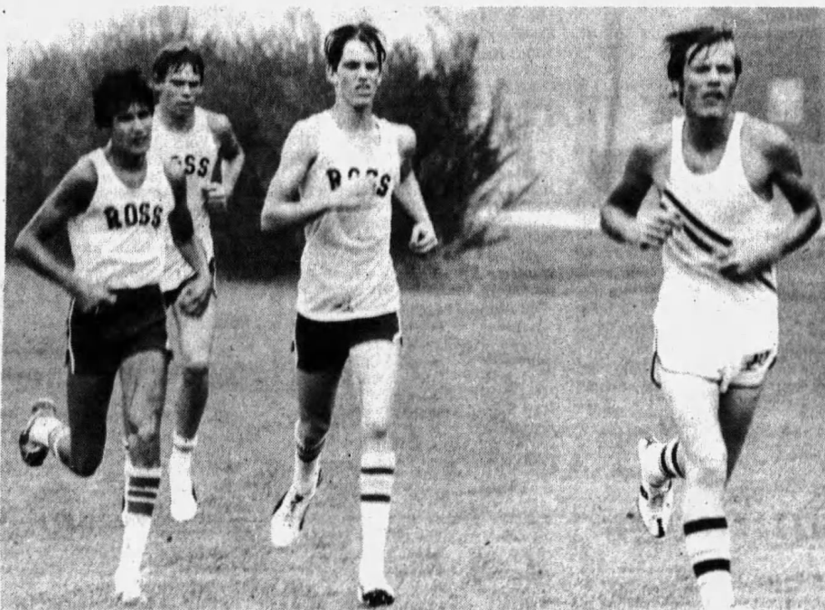
THREE ROSS runners follow an Oak Harbor runner to the finish line. The race was run in a steady rain which

So much for freedom of speech. But have no doubt about it. The first shots have been fired. Concord, Valley Forge and the Alamo may pale by comparison before ABC and Denver are done.