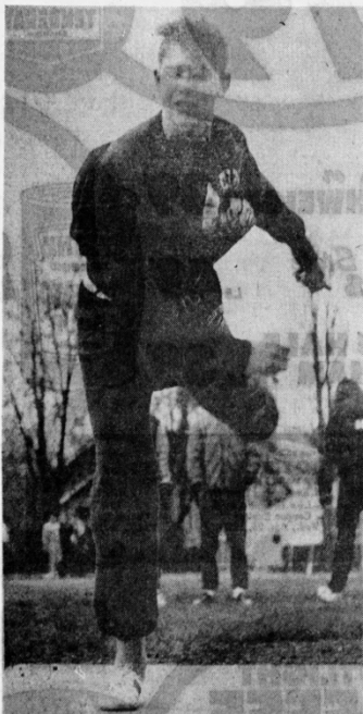
PORT CLINTON'S ARFT AFTER DISCUS RELIEF Part Of Record-Setting Teams In Discus, High Jump