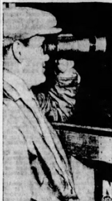
It's Joe Cronin, manager of Red Sox, scanning sky from observation post in Boston area. He leads group of his players, which alternates with National League Braves, as volunteers in Aircraft Warning Service.