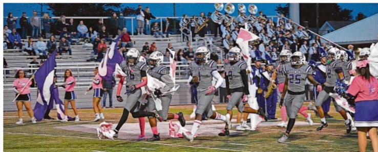
Fremont Ross players burst through a banner to kick off Friday night's homecoming celebration.