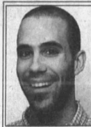
Around the Horn

"This is something we were hoping would happen. If you asked those close to the program after the preseason where we had key players out with football injuries and we were behind and not playing well they would have said we'd be hard pressed to win six games. As the health and