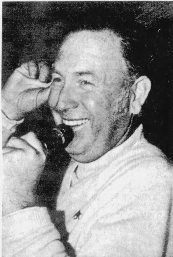
PRO GOLFER BILLY CASPER